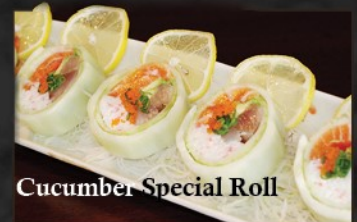
Cucumber Special Roll