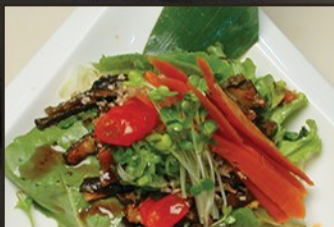
Salmon Skin Salad Salmon Skin Salad