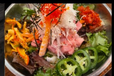
*Spicy Sashimi Bowl