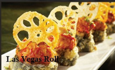
Las Vegas Roll