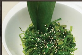
Seaweed Salad Seaweed Salad