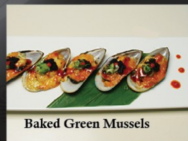
Baked Green Mussels