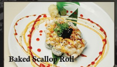
Baked Scallop Roll