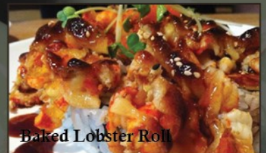
Baked Lobster Roll