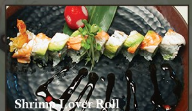
Shrimp Lover Roll